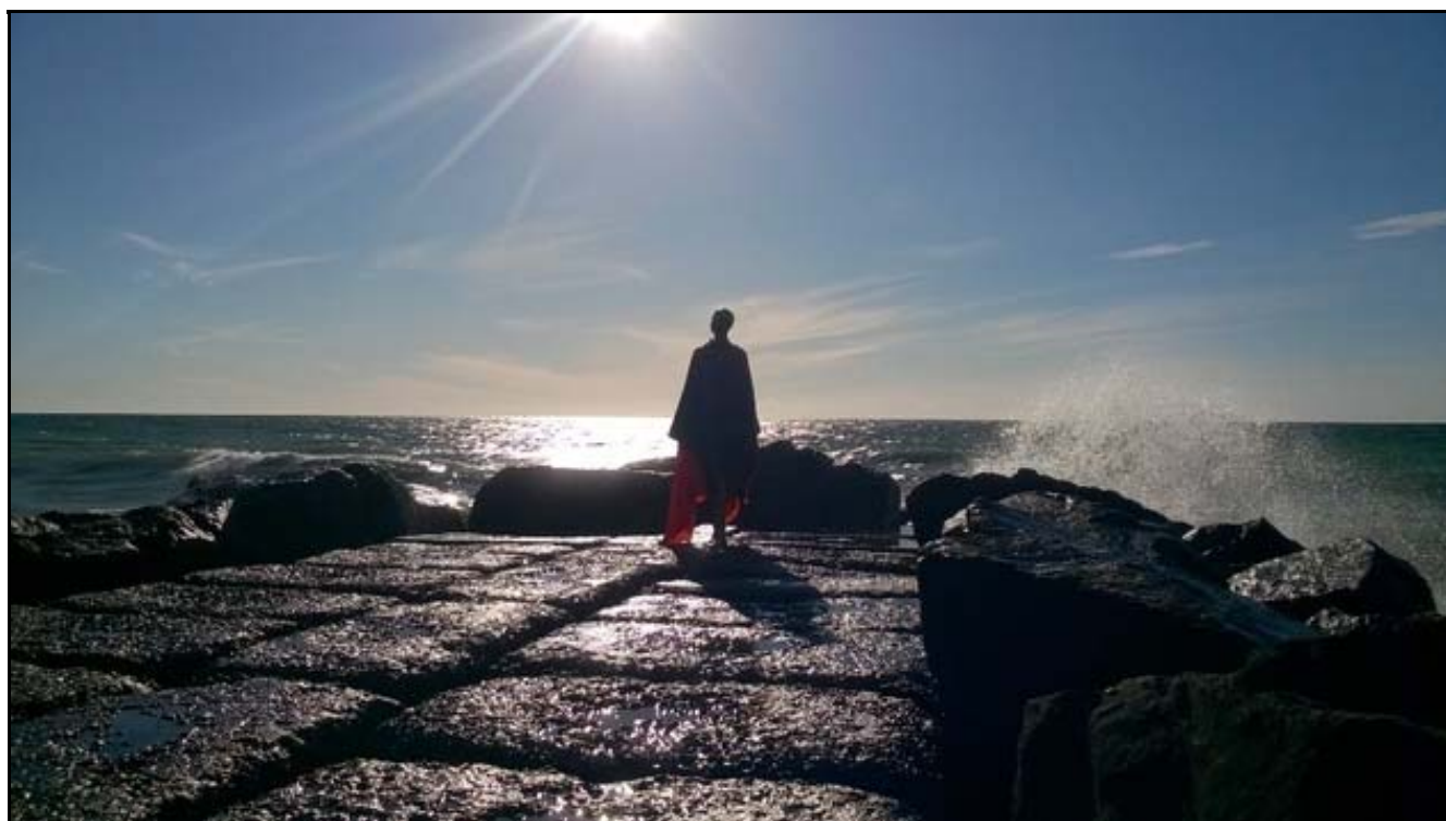
"The refugee who looks toward a brighter future, but the sea is in between!" A vision of a Refugee Sculpture in each port.