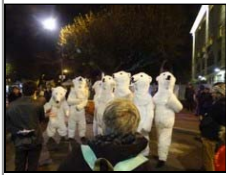
Polar Bear army (COP21, Paris)