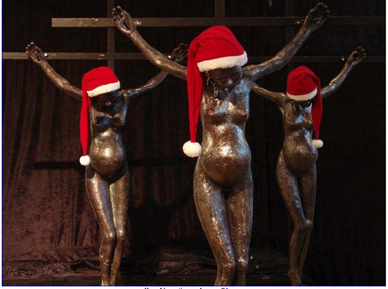
One of 6 greeting cards - see all here.