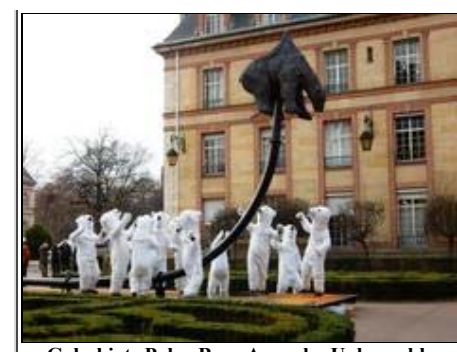
Galschiøts Polar Bear Army by Unbearable sculpture