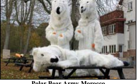
Polar Bear Army Morocco

The 10 The Pillars of Scriptures will be exhibited in the middle of their parliament. On the sculptures' screens the 100 darkest and brightest quotes from the New Testament, The Torah, and The Quran are shown in 9 different languages. Jens Galschiøt and four of his colleagues will watch over the installation in Bruxelles. More about this in the new year.