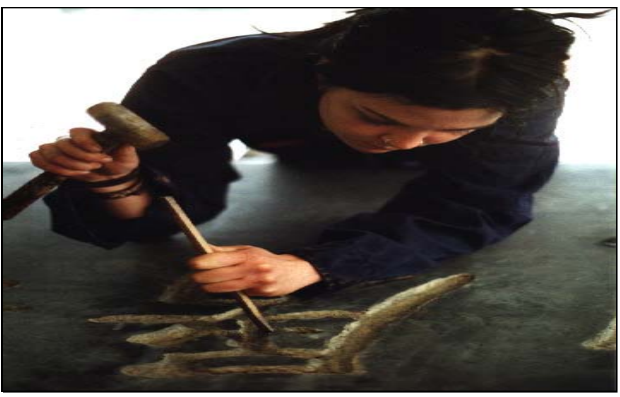
The Chinese sight for "The old cannot kill the young forever" chiseled into the socket on the memorial.

Unsubscribe / Change Profile *** Forward this email to a friend *** Click here to view this email in your browser