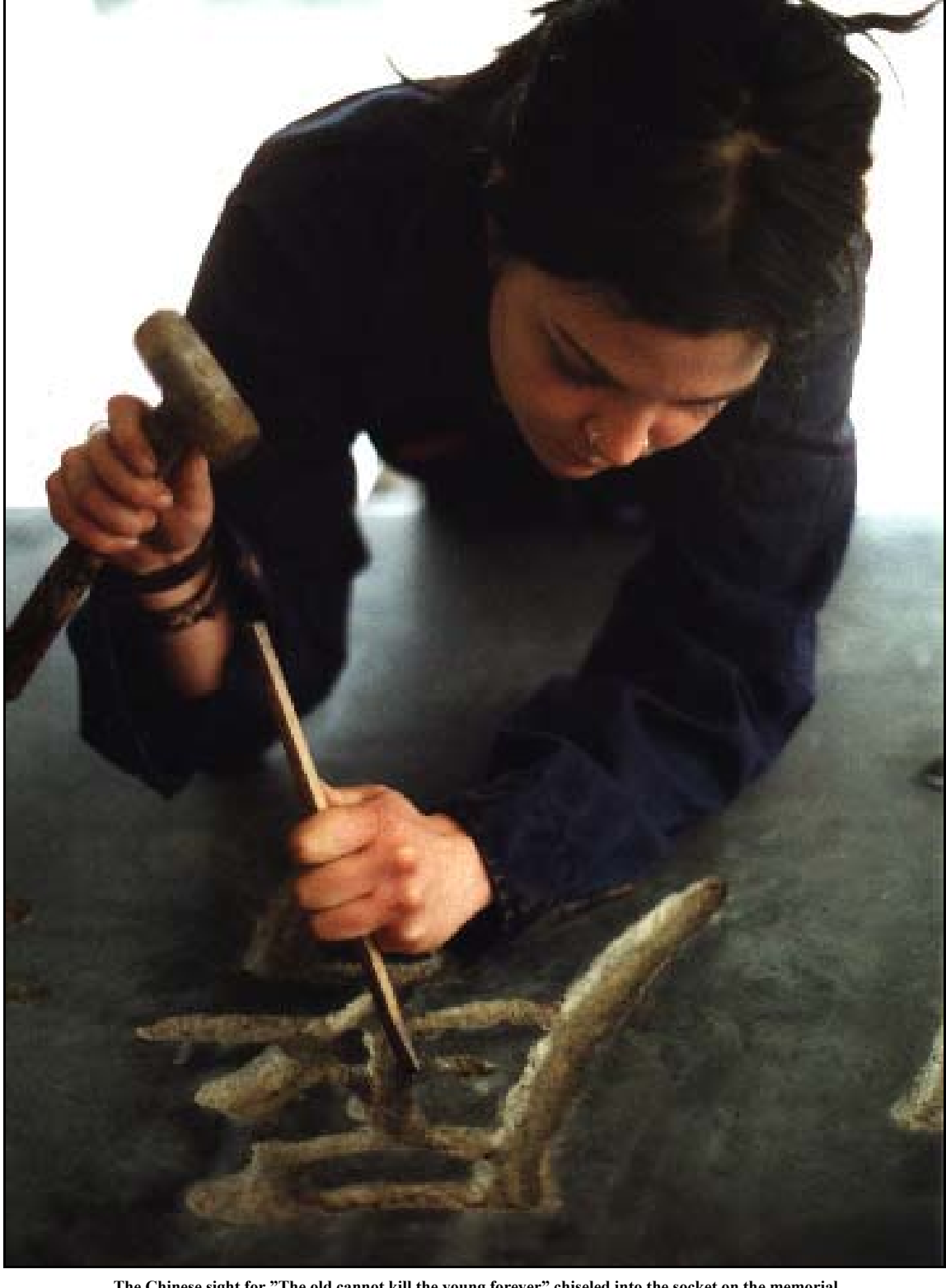
The Chinese sight for "The old cannot kill the young forever" chiseled into the socket on the memorial.