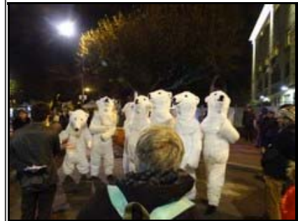
Polar Bear army (COP21, Paris)