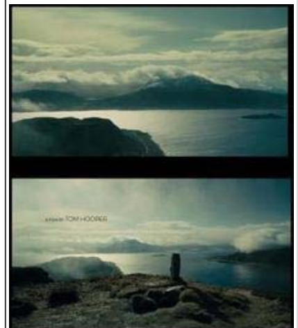
Scenes from the Movie "The Danish Girl"