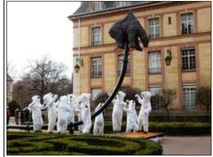
Galschiøts Polar Bear Army by Unbearable sculpture