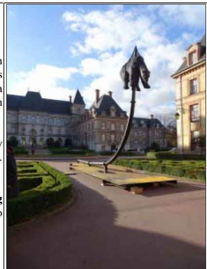
The sculpture Unbearable

Galschiøt also suggested to invite the Nicaraguan Catholic women's rights movement