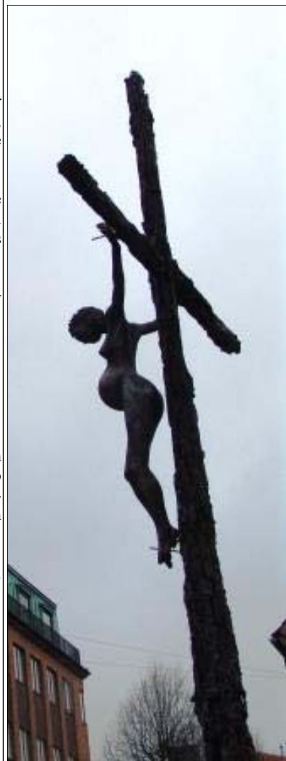
The Pregnant Teenager / In the name of God