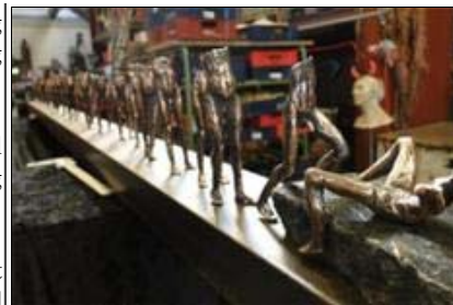
550+1 - a 60 meter long sculpture which focus on prostitution and trafficking

At Gallery Galschiøt we have made a small exhibition of Gerda and Einar Wegener in connection with the movie "The Danish Girl" which just won an Oscar. Great was our surprise when we saw the movie and found out that the painting that hangs in the gallery might have been inspiration for the movies final scene.