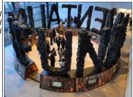
The sculpture Fundamentalism