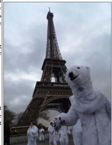
Galschiøts Polar Bear Army - during COP21 in Paris. Now it travels to New York to put focus on the climate.