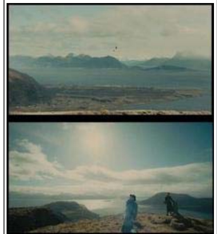
Scenes from the Movie "The Danish Girl"