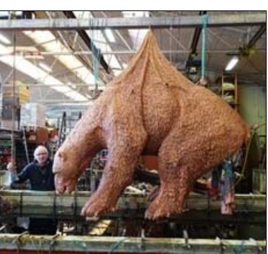
Making The Polar Bear

The sculpture symbolizes the conflict between the western world's concept of freedom, as a right for unbridled consumption versus the concern for the climate and the planet. Do we have the right to live the way we do?