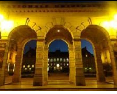
Cité internationale universitaire de Paris

*Originally this event was ment to go on in Paris, but due to the state of emergency, the Paris manifestation have been canceled.