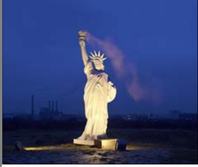
Freedom To Pollute, 6 meters tall.

Apart from Unbearable Artist Jens Galschiot exhibit a number of art installations around Paris during COP21, which highlight the climate crisis from different angles. 25 Danish art-activists will help make the sculptural manifestations a reality in Paris. So will 10 polar bear suits and a mobile klezmer discothèque. Herunder you will find some of the events we will attend. We are still a bit unclear about these exact events due to the state of emergency in Paris.