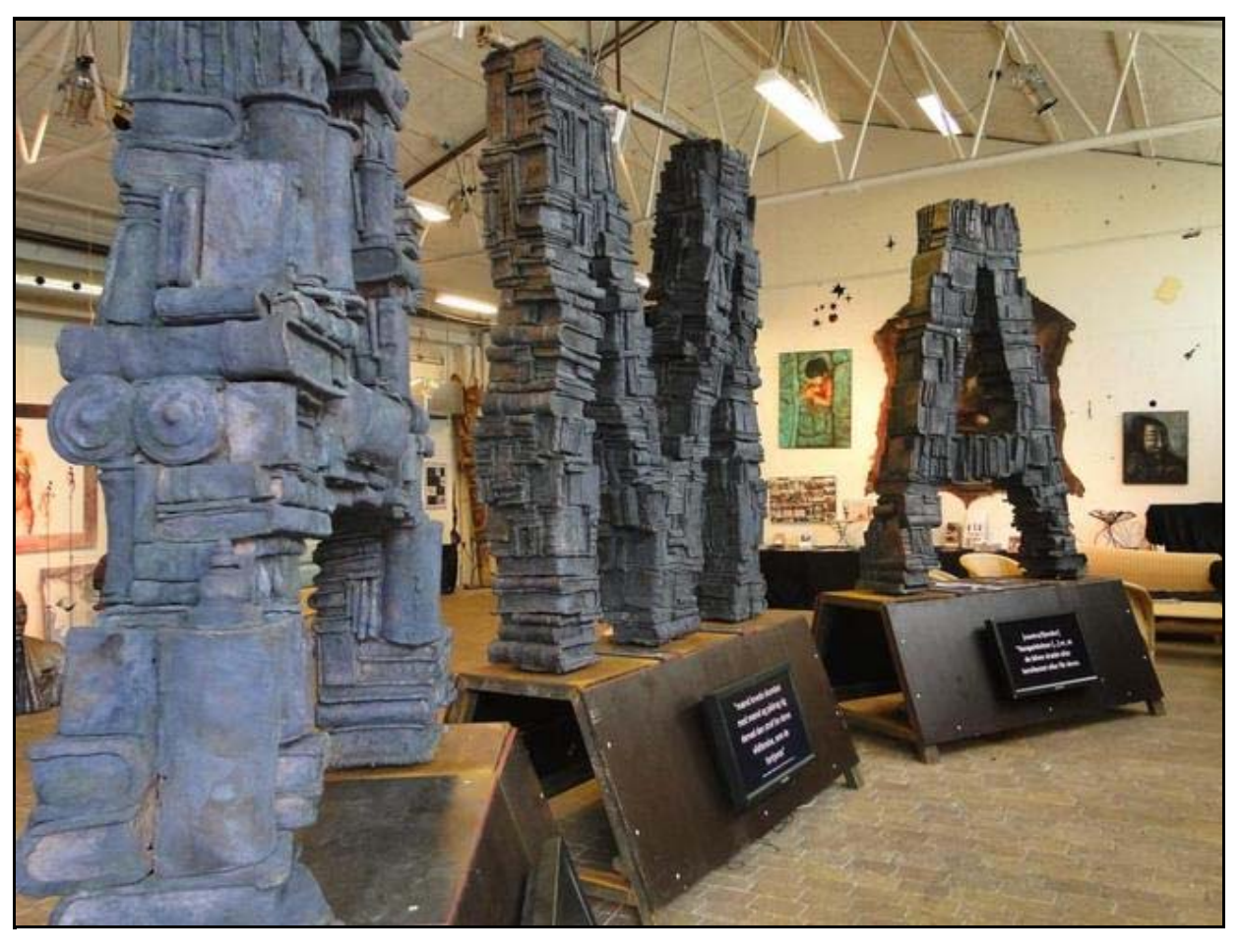
The sculpture "Fundamentalism" in Jens Galschiot's gallery in Odense (DK).