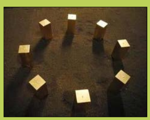
An Ocean of Inequality is a walk trough 1576 tons (3.6b) of tiny stones which leads to 8 guilded pedistals. They own the same!