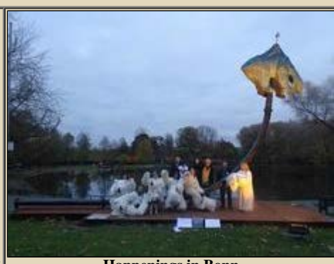
Happenings in Bonn

We are currently working to get the sculpture Unbearable to the United States for several exhibitions. Afterwards it is going to Poland for COP24 climate summit.