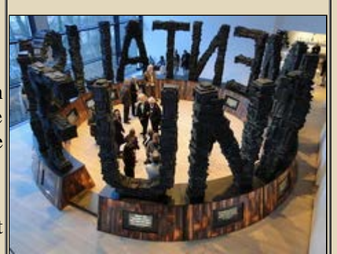
The Sculpture Fundamentalism

Now the city's schools , libraries and cultural institutions will get involved in order to make a constructive debate about Judaism, Christianity and Islam, the religions' differences and (many) similarities and their dark and bright sides.