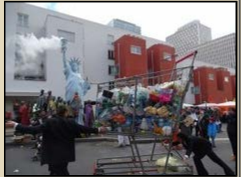
COP21 - Paris, 2015

He has named this art and dialogue project 'The Children of Abraham'. The focal point of the project is the 3.5 meter tall and 70 square meter sculpture called F.U.N.D.A.M.E.N.T.A.L.I.S.M. It is made of these letters made in 8,000 copper books symbolizing the Torah, the Bible and the Quran. 24 big monitors constantly display the 'brightest' and the 'darkest' quotations form Judaism, Christianity and Islam. See concept click for the art project English -German - Danish