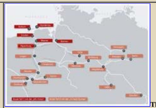
Refugee Ships will visit 24 harbours in Germany this summer. See sail plan

This summer, the The Refugee Ship will be visiting over 24 German cities to raise awareness about the refugees knocking on Europe's door,