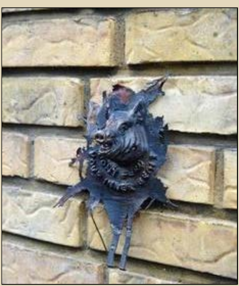
Thousands of Inner Beasts will be handed out and put in public spaces. They will remind us to be aware of our 'Inner beasts' and treat fellow humans right.