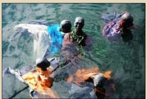
'Drowning' Refugees (Sculptures)