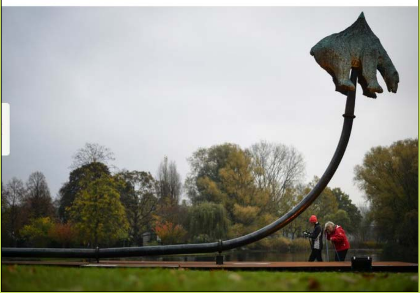
Galschiots sculpture Unbearable.