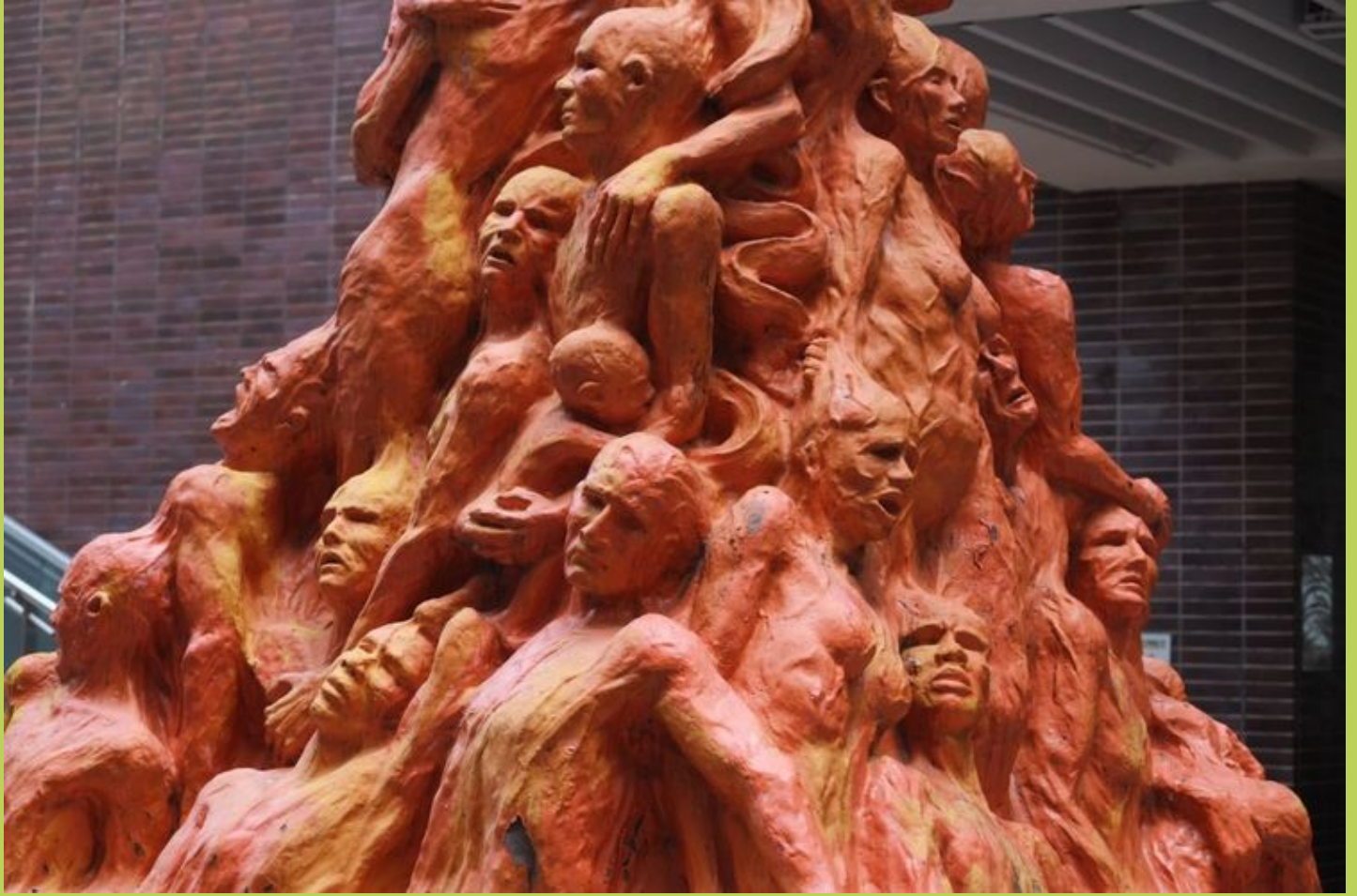
The socket on the memorial.