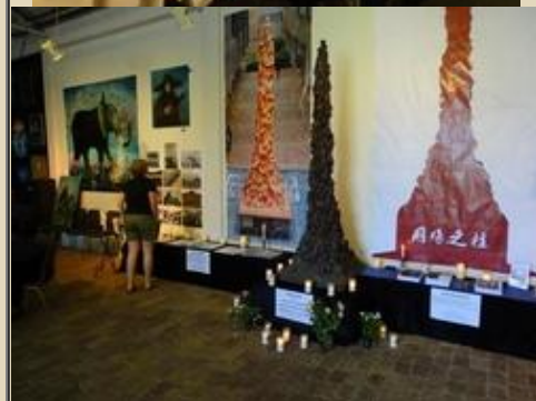
Galleri Galschiot mark the 30 th anniversary of the Tiananmen massacre