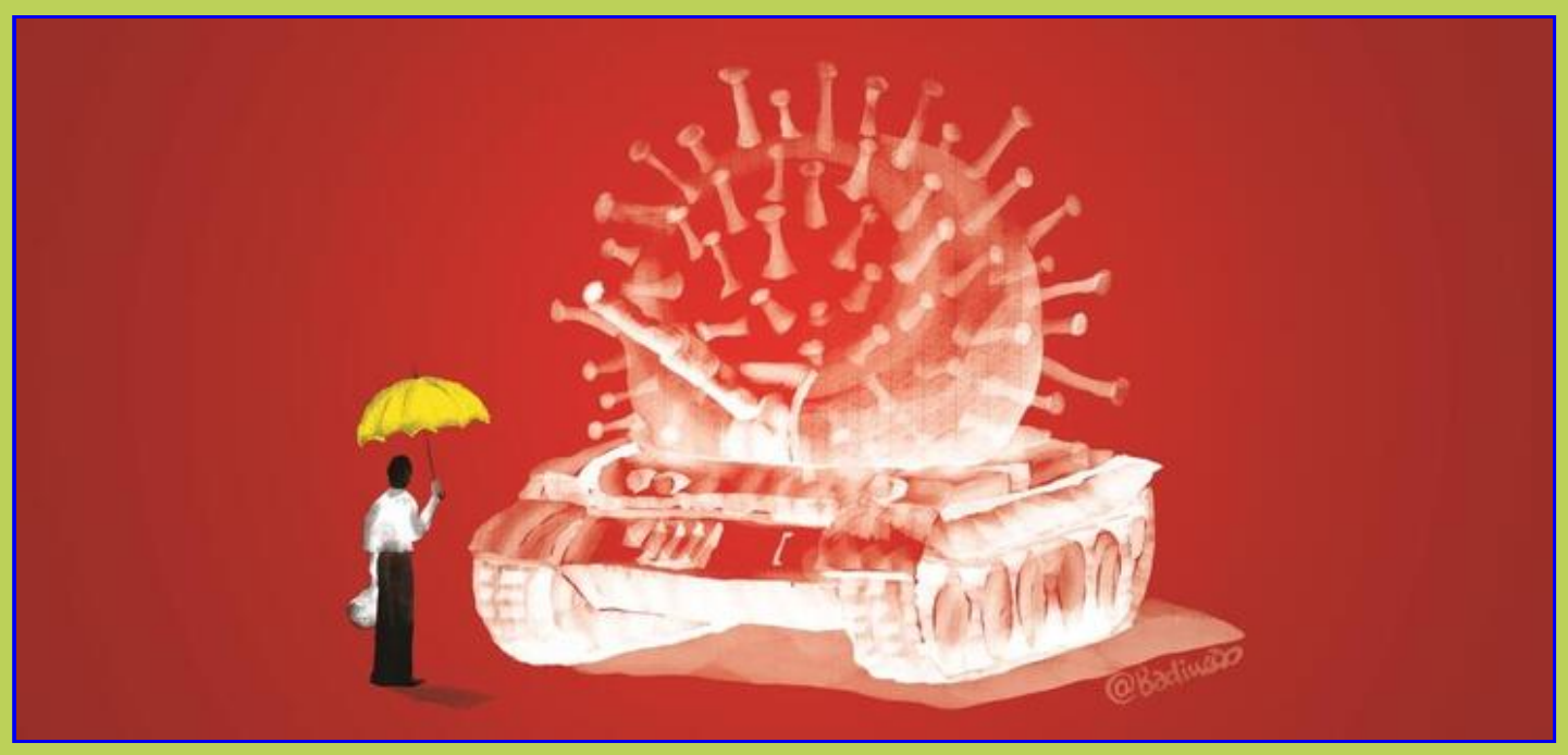
Drawing by Badiucao placed on the Pillar of Shame: It is artistically brilliant that he has managed to link the brutal use of power, the democracy movement and the exploitation of the corona crisis. At the same time, there are references to the 1989 Tiananmen massacre, where China slaughtered thousands of peaceful protesters fighting for basic democratic rights. History now repeats itself 30 years later with young people in Hong Kong fighting to preserve these rights

Appeal to the press, culture- and art institutions, artists, working places, libraries, universities and others.