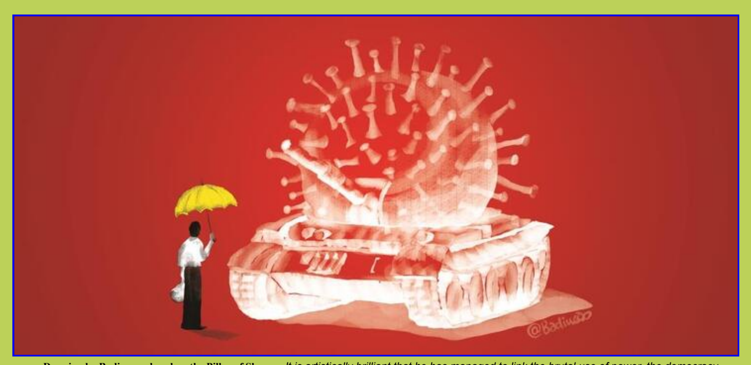
Drawing by Badiucao placed on the Pillar of Shame: It is artistically brilliant that he has managed to link the brutal use of power, the democracy movement and the exploitation of the corona crisis. At the same time, there are references to the 1989 Tiananmen massacre, where China slaughtered thousands of peaceful protesters fighting for basic democratic rights. History now repeats itself 32 years later with young people in Hong Kong fighting to preserve these rights

Appeal to the press, culture- and art institutions, artists, working places, libraries, universities and others.