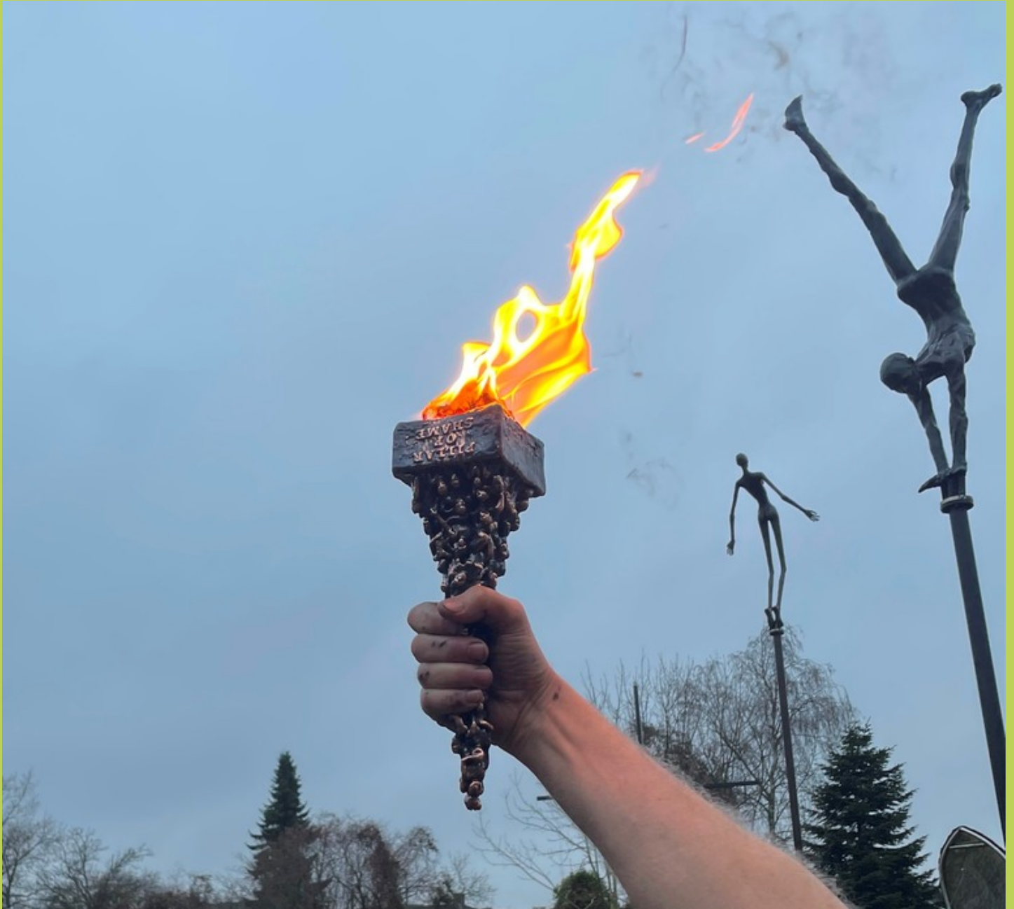
Foto kan bruges uden copyright: Kobber model af Skamstøtten, kan også bruge som OL fakkel til vinter OL i Kina- 4 til 20. februar 2022. Det er Jens Galschiøt der holder faklen

Du ønskes hermed en god jul og et forrygende nytår.